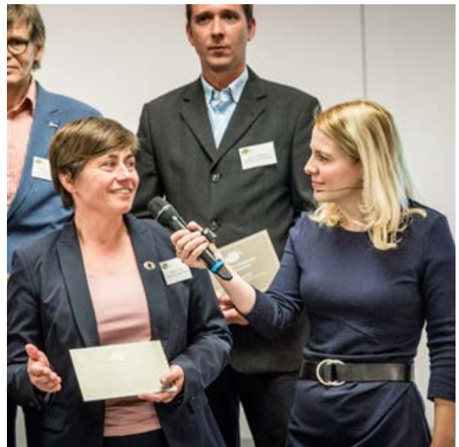
Ökoprofit Anniversary 2019, Hanover