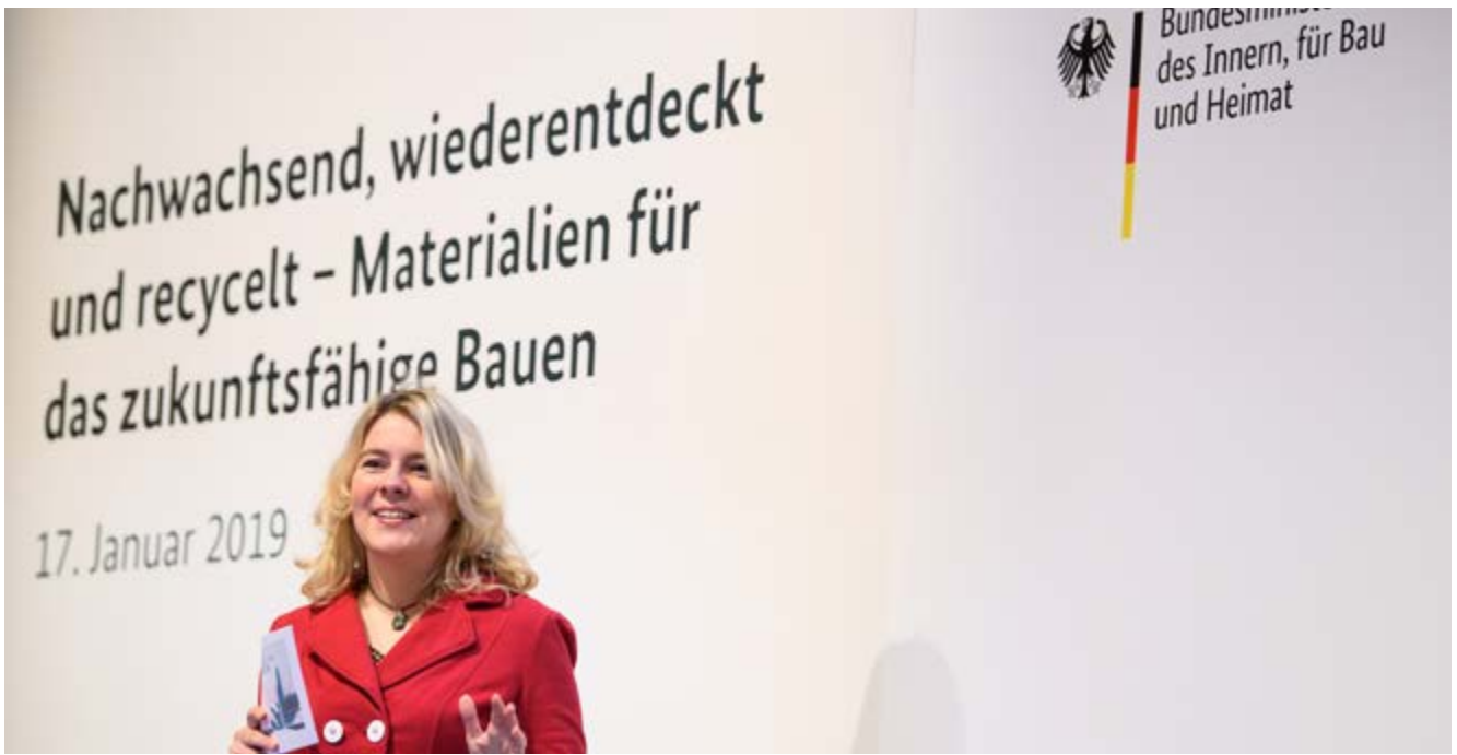
Sustainable Building / Expo Real 2019, Munich nachhaltig.digital Conference 2018, Bonn