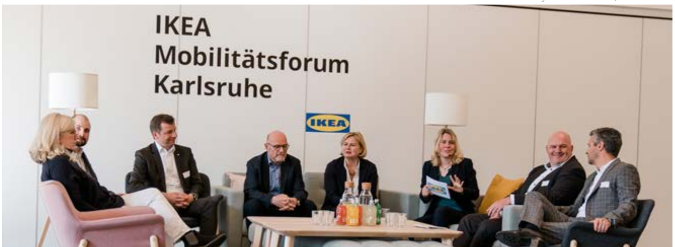
IKEA Mobility Forum 2019, Karlsruhe